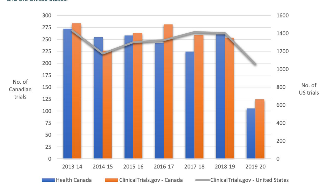
CHART 1: Numbers of clinical trials registered between November 1 and March 15, 2013-14 to 2019-20, Canada and the United States.

In addition, according to another recent study, the number of clinical trials registered by Health Canada between November 2019 and mid-March 2020 fell by 52% compared to the average number registered during the same period in the previous six years (see Chart 1 below).<sup>3</sup> Of note, this drop in clinical trials occurred prior to COVID-19 hitting Canada, and much of this research includes high-cost, multi-centre clinical trials for cancer and other life-threatening diseases as opposed to minor studies such as Phase 1 studies and bio-availability and bio-equivalency trials that are aimed at generic medicines.